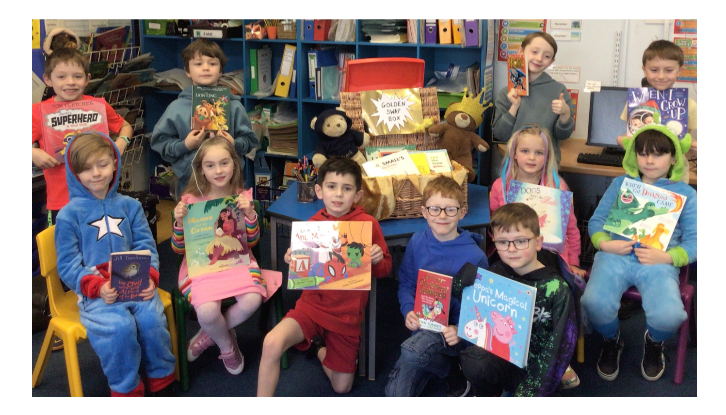
The children loved sharing their favourite stories with each other.